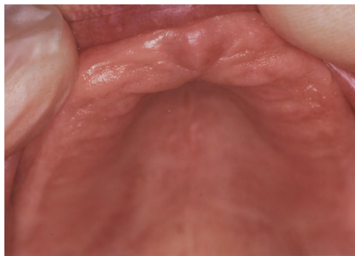
Figure 2. After treatment. Same patient as in Figure 1 after 10 days of using 0.8% chlorine dioxide mouth rinse. Clinical oral score now grade 0, with salivary count of 370 CFU/ml.

unwanted effects were recorded at each visit. The lag time between use of the ClO 2 and sampling was 6 hours.