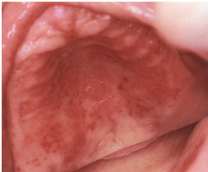
Figure 1. Before treatment. Chronic atrophic candidiasis (oral soft tissues score grade 3) and salivary count of 40,000 CFU/ml.

Patients were examined at baseline and 10 days after treatment. We chose to examine the patients at these time intervals to be able to assess the effectiveness of DioxiDent within the same timeframe as that of the known effectiveness of currently used topical antifungal medications. Each patient received the chlorine dioxide medication, 0.8% (DioxiDent – Frontier Pharmaceutical, Inc., Melville, New York, USA), which was supplied in the form of two liquids. The active ingredient in part A consisted of sodium chlorite and in part B consisted of a weak acid. The combination of equal parts of A and B yields chlorine dioxide as the product. Patients were instructed to mix approximately 15ml of each of the two parts, A and B, of the DioxiDent, to rinse the mouth with it, to keep it in contact with the tissues for 1 minute and then expectorate. Patients repeated this twice daily, in the morning and at bedtime. In addition, patients were instructed to soak their dentures in the ClO 2 mixture overnight. Any