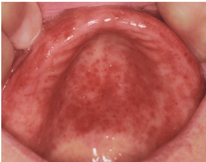
Figure 3. Before treatment. Chronic atrophic candidiasis (oral soft tissues score grade 3) and salivary count of 52,000 CFU/ml.